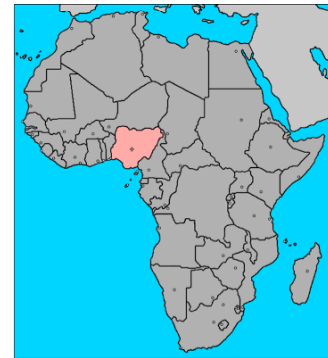
Fig. 1.0: Map of Nigeria showing the states in the Niger Delta

could utilise them. The Ogoni refugees were severely under-compensated in return for surrendering their land 1 . The Ogoni began fighting back in December of 1992 and the next few years saw acts of aggression from both sides. Later, in 1998, two thousand young men and women representing the Ijaw people marched through the state capital protesting peacefully, where they were met with open fire by the